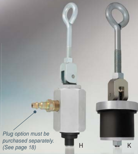
Plug option must be purchased separately. (See page 18)