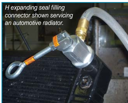
H expanding seal filling connector shown servicing an automotive radiator.

The connectors are suitable for operation from -20° to 250° F (-29° to 121° C).